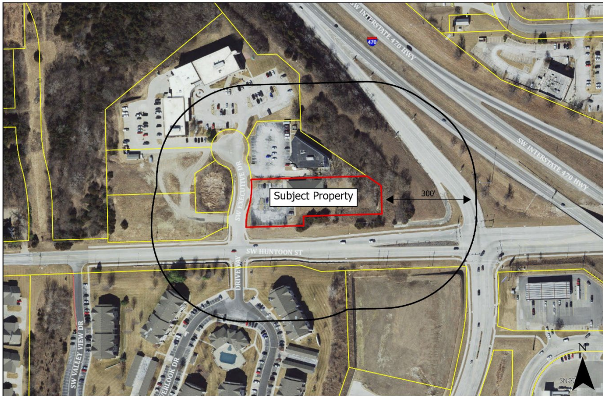
City of Topeka Planning Division