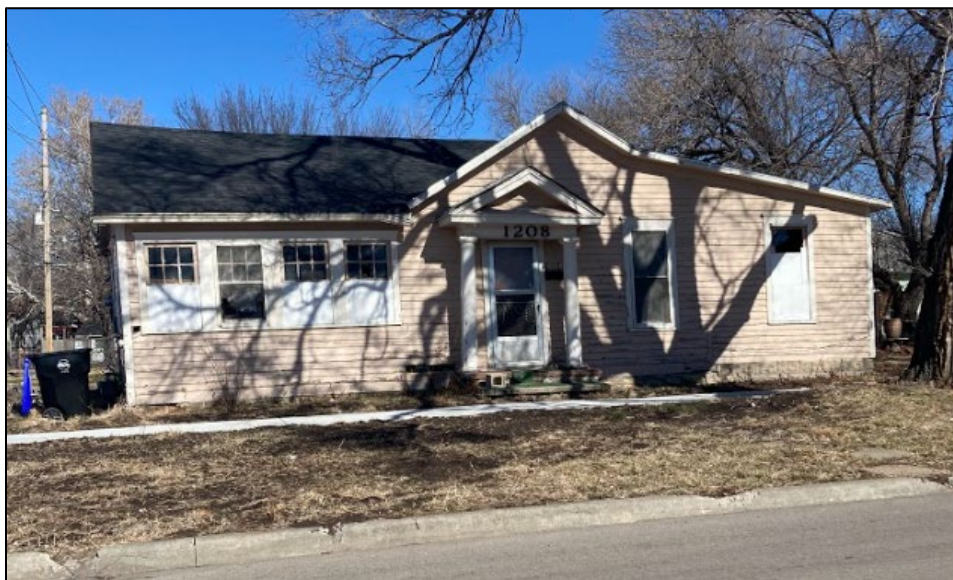
1208 SW Munson Ave