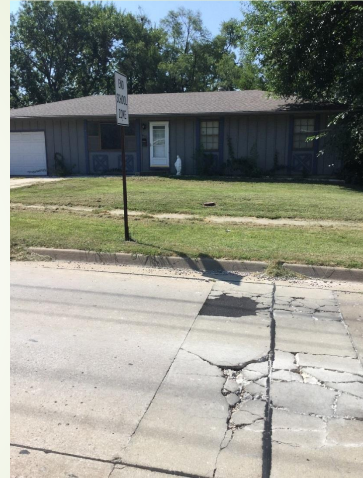
SW 29 th – Patch Failures