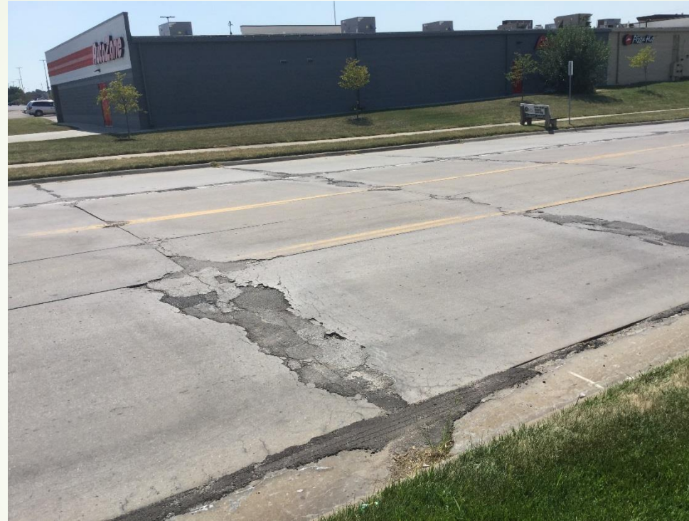
SW 17 th – I470 to Wanamaker