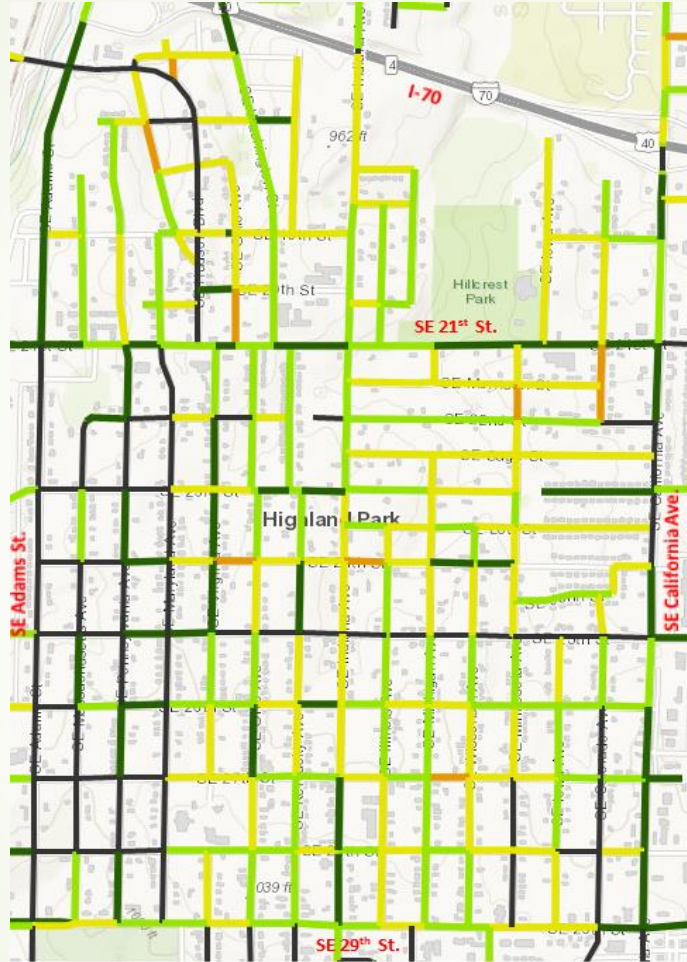
Central Highland Park