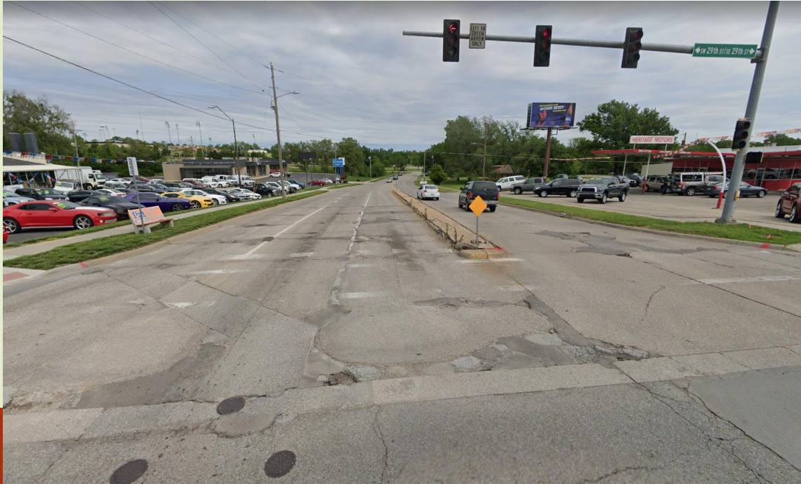
SW 29 th /Kansas Ave Intersection